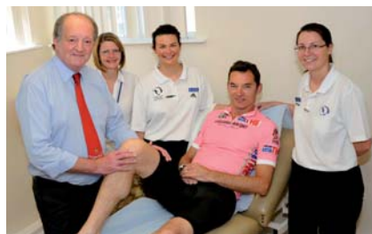
Oswestry's Sports Injury Team

http://www.rjah.nhs.uk/clinical-departments.aspx