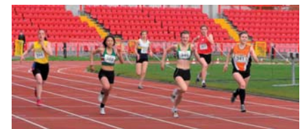
U17W 300m Final