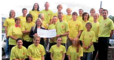
Manx Athletes in Finland

From Sunday 28 June to Friday 3 July a party of twenty northern athletes competed at the XIII Island Games in Aland, Finland, representing the Isle of Man.