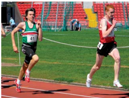
U15 Boys 800m Final

On Day 2 of the Northern U15/U17 championships it was a case of seeing double with Carys Hall (City of Sheffield),