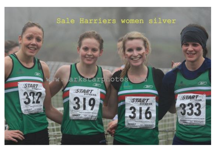
Silver for Sale women as well