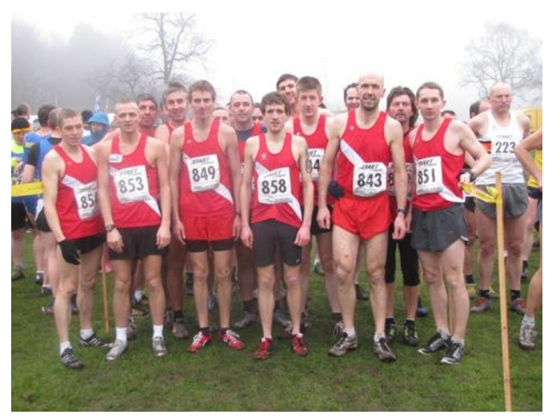
Salford men made a big effort but had to settle for silver team medals