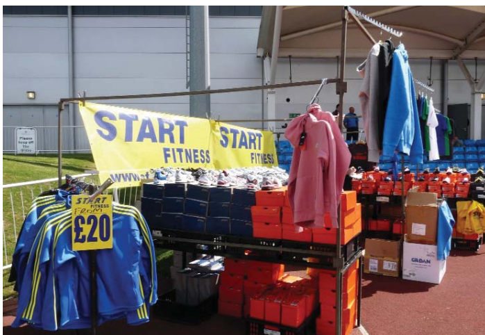
Start Fitness stand at Senior and U20 Track & Field Championships 2010, Sportcity.

Our main sponsor, Start Fitness of Newcastle is now also sponsoring our newer events. This sponsorship, which is a combination of in kind and monetary support, is much appreciated and also means that athletes will be able to purchase Start Fitness discounted merchandise at events throughout the year. To access the online catalogue, please click on the Start Fitness logo on the left hand side margin of the Northern Athletics site at: